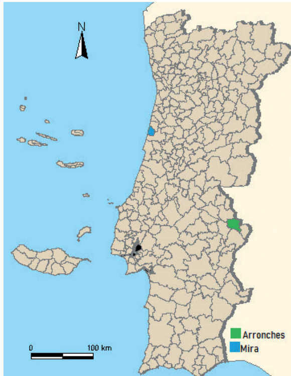
Map 1. Location of the School groups where there were Teaching Laboratories.

It has two public education establishments distributed across several teaching levels. It was attended by 242 students organized into 14 classes, with 30 students in pre-school, 85 in primary education, 41 in middle education, and 69 in lower secondary education. Apart from the regular teaching, it also accounted for LIJE – Home for children at risk (18 students), the professional technical course of support to sports management (8 students), and PIEF (10 students). As a whole, the students with special educational needs were 43 out of 241 (17.7%) of the school population. Affiliated to the special needs' students, the school had three teachers.