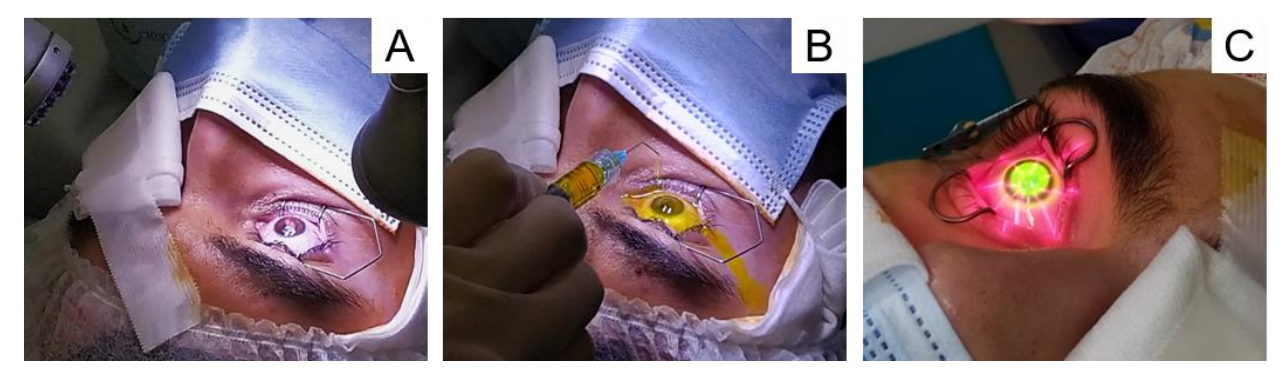
Figure 2 - Epithelium-off Accelerated Corneal Collagen Cross-linking

Regardless of the reported efficacy and safety of the corneal CXL procedure, there have been reports of continued disease progression and worsening of visual acuity, the reasons for which are not well understood (20). In fact, efforts to use corneal pachymetry, keratometry and patient factors such as age, gender, and visual acuity as predictors of success have yielded inconsistent results (20).