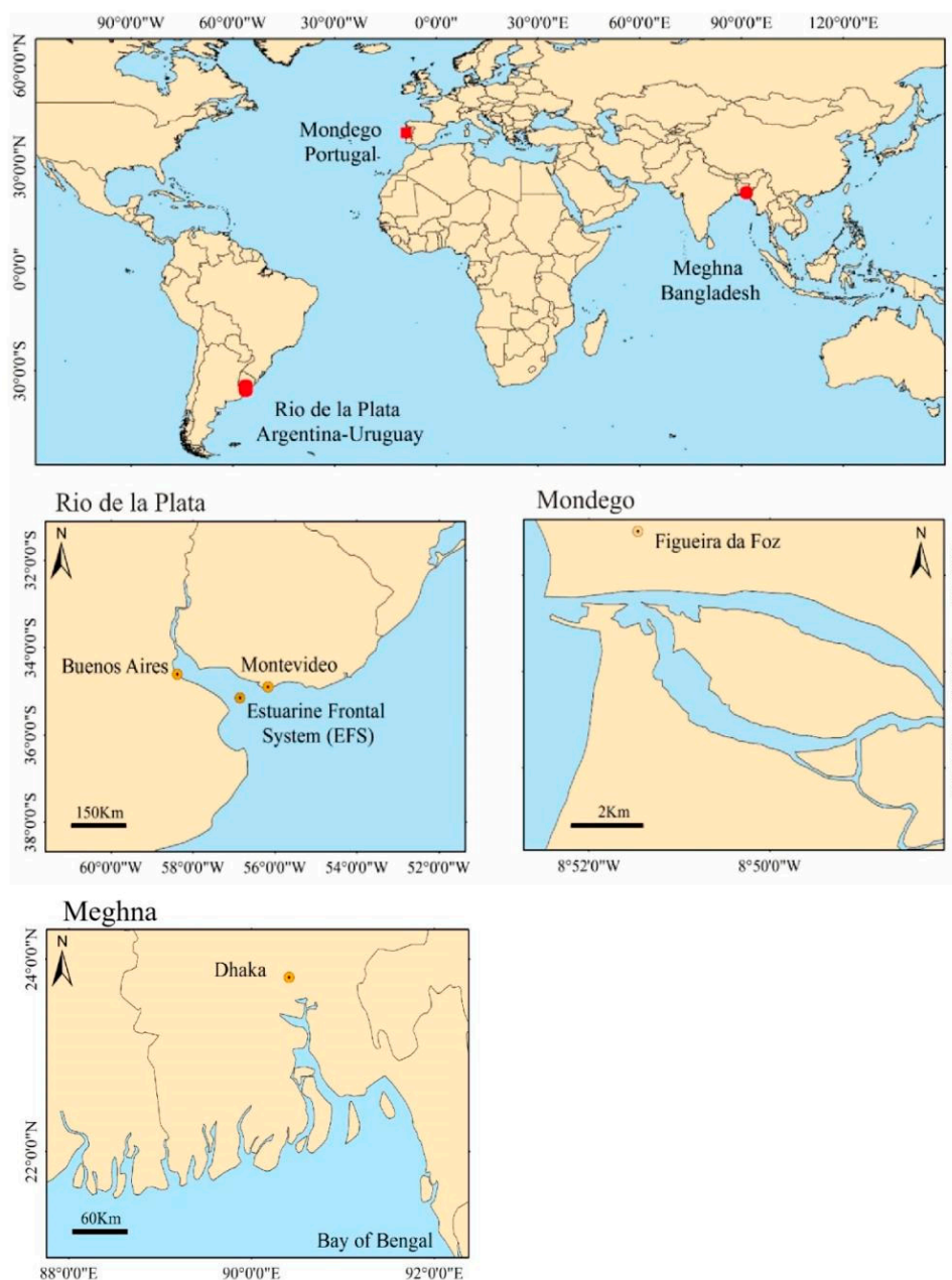
Figure 1. The geographical locations (above) and detailed descriptions of the three estuaries, i.e., Rio de la Plata (RdIP) in Argentina-Uruguay, Mondego in Portugal and Meghna in Bangladesh.

influences on plankton, fishes and fisheries. Finally, in the discussion, we summarised the main adaptation strategies followed in the studied systems.