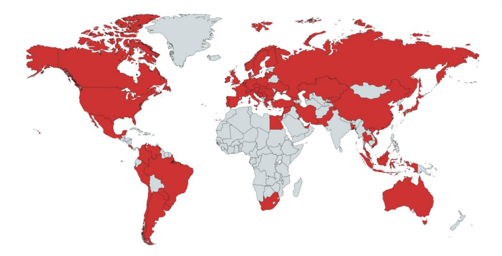
FIGURE 1 Countries with Pocket Guide members