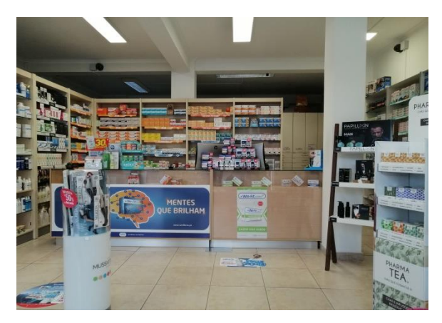
Figura I – Front office da Farmácia Sanal

Os proprietários da Farmácia Sanal possuem, para além desta, a Farmácia São José em Sangalhos, localidade vizinha de Oliveira do Bairro.