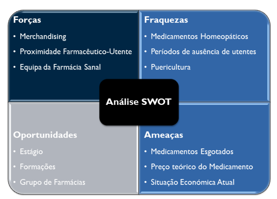
Figura 2 – Esquema da Análise SWOT relativa ao período de estágio em farmácia comunitária.

A apresentação do meu relatório de estágio, sob a forma de análise SWOT um acrónimo para Strenghts , Weaknesses , Opportunities and Threats , que se traduz em Forças, Fraquezas, Oportunidades e Ameaças e visa uma compreensão sintética e esquemática da minha análise pessoal correspondente a este período.