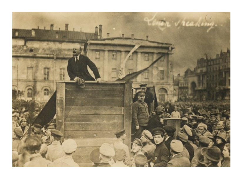
Figure 6: Vladimir Lenin speaking to the Red Army Soldiers in Moscow before the departure to the polish front, in 1920