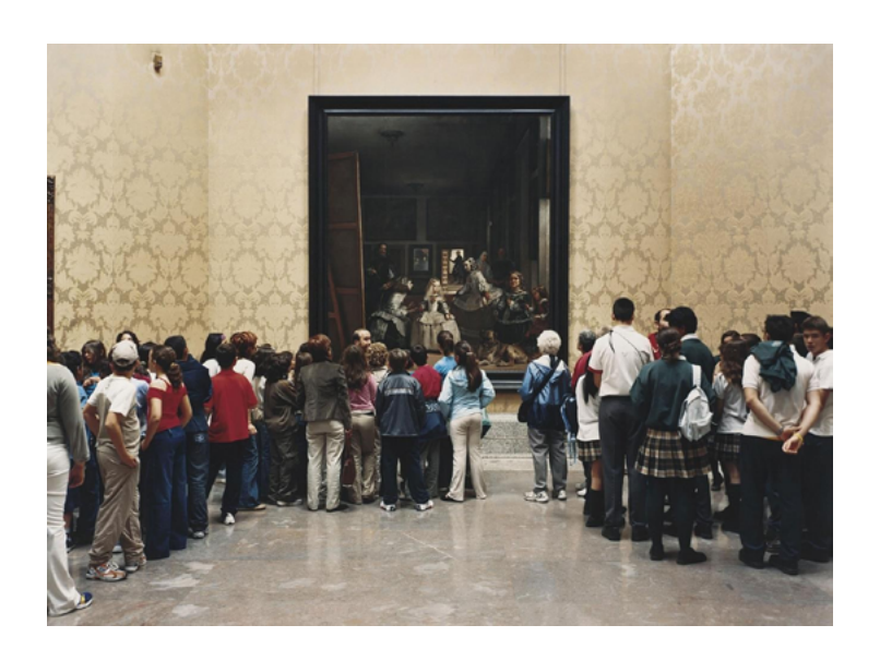
Figure 11: Thomas Struth, Museo del Prado, Room 12, Madrid, 2005

This situation is a starting point to understand how images collaborate (now) with each other. This is a broad question that calls both for an analysis of the evolution of cinema and for the museological framing of the experience of moving images, and, on the other and, for hermeneutics of painting from the 1980s to the present. This historical moment is characterized by appropriations of cinema and its legends, by the politicization that aims to denounce and counter a contemporary dystopia, through a reformulation of the concept of installation, performance, and parody. A key name in this context is Richard Prince (1948), who appropriates famous advertisements from American cultural mythology such as the Marlboro cigarettes' cowboy, making this image (and others of the same nature) cohabit in the same imaginary with paintings of nurses and other icons of popular fiction.