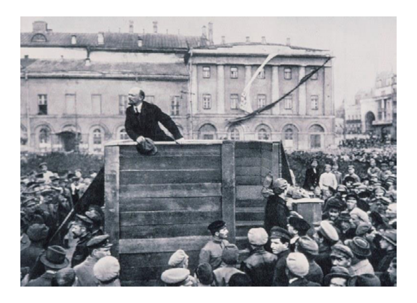
Figure 7: Leon Trotsky erased from the same picture

Reconstruction of history, using re-composition of images is linked to the glorification of the hero. However, suppressing the images of unwanted people was not the only strategy: this glorification also employs the erasing of a face by covering it with ink stains. Such was the case with the picture of Djakhan Abidova, member of the Communist Party of Uzbekistan.