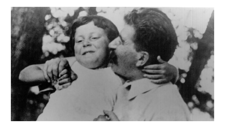
Figure 3: Photo of Stalin carrying his daughter

Sometimes, photo doctoring meant going back to the past to change the historical record. (Blackmore, 2019, § 11)