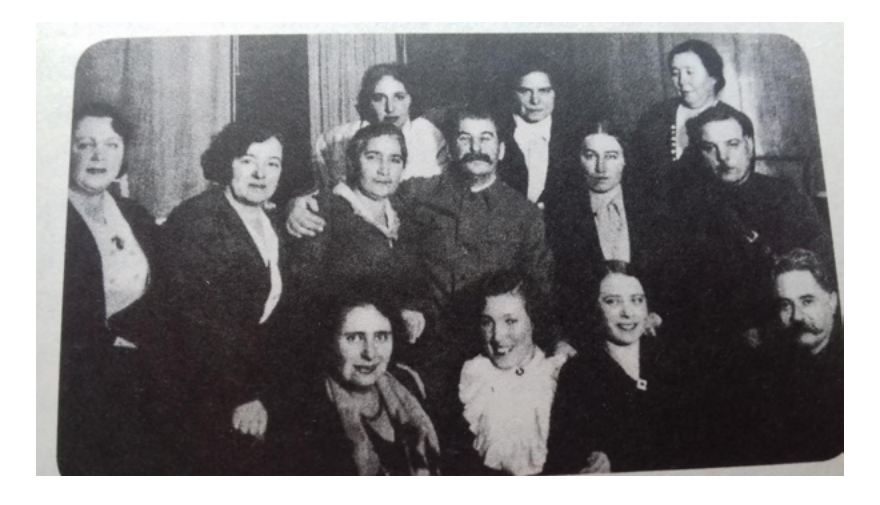
Figure 5: Photo of Stalin with his family on his birthday on December 21, 1934

Stalin's characteristic paranoia that resulted in a persistent feeling of being threatened led him to exterminate people whoever they were, including members of his own family, especially during the infamous times of "terror". In fact, the majority of people posing for a family photograph in 1934 – taken on Stalin's birthday –, including members of the politburo, wives of soldiers, but also scientists and close family members, would all be expunged from Stalin's family entourage in the 40s. Since this picture was a "family photograph" the presence of those people was not erased, as was the case with other pictures in an official, public context. Their faces remain in the picture, but exclusion had already happened.