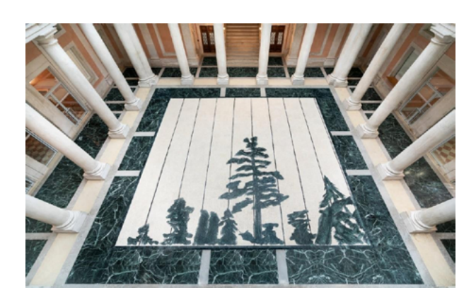
Figure 13: Luc Tuymans, "Schwarzheide" in the "La Pelle" exhibition at the Palazzo Grassi, Venice

images and the objects. The exhibition was part of a project dear to the artist that consisted of transposing, using the time (a Heideggerian time?) of Villa Wannsee, where on January 20, 1942, "the final solution" was discussed at the highest level.