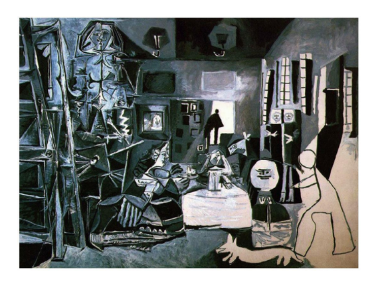
Figure 10: Pablo Picasso "Las Meninas", after the painting by Velazquez, 1957. Picasso Challenging the Past Catalogue

This means that a critical response to the political, ethical, social and economic problems conveyed in the contemporary flow of images must be organised on the basis of painting defined as a concept rather than a technique . This implies a re-organization of the way we look at images, being grounded/anchored in the process and the imagery of painting, in a reinvented plasticity. Deleuze, Derrida, Perniola, Foster, Bourdieu, to name but a few of the thinkers – not to mention the theoretical input of countless artists – have been fuelling this debate, which also embraces the rhetorical status of the images, its mythological plane (Barthes, 1976) and its spectacle condition as commodity (Debord, 2018), together with anthropological specificities, rituals of collective memory. Such a response still allows us to find our bearings in a universe of things . Thus armed, we can hazard an intelligibility transformed into an open experience of what is meaningful, where infinite personal encyclopaedias are conjoined and declined (Eco, 2004).