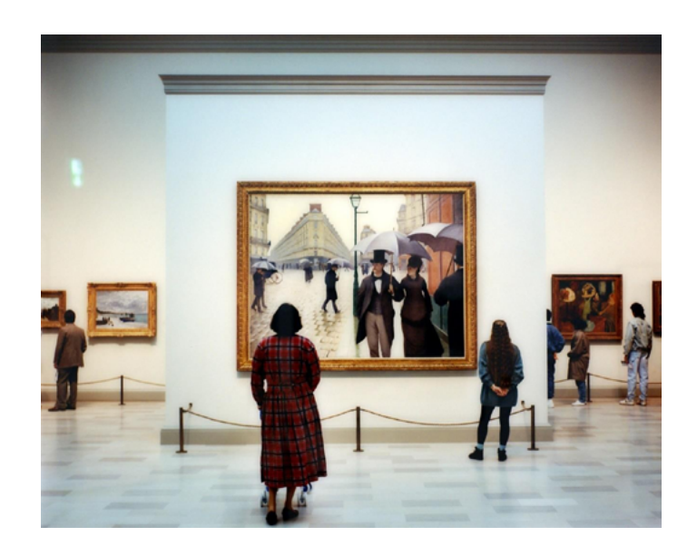
Figure 12: Thomas Struth, Art Institute of Chicago II, Chicago 1990

programme sites of the great contemporary arts museums, not to mention the real and effective distribution in the exhibitions media, to be aware of this eloquent diversity that renders images porous, enmeshed in reciprocal contamination. In this milieu of communication, painting resurfaces and stands with a mission to interpret, decanting the chaos of senses conveyed by most other images.