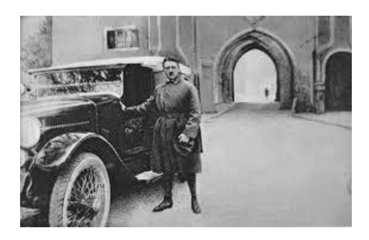
Figure 1: Hitler leaves the prison in Landsberg on December 20, 1924

dictator, after nine months in the prison of Landsberg in Bavaria. Hitler had been accused of treason.