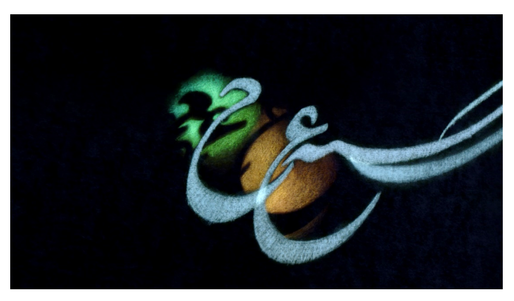
Figure 2: Mohammad Javad Khajavi, The Third Script (2017), animated short film. (Courtesy of the artist).

While these kinds of collaborative performances have become more popular in recent years, the possibility of creating audio-visual interactions by means of such time-based media as animation and film has opened up an entire new vein of artistic opportunities for interactions between calligraphy and music. Clearly inspired by the musical analogies used in describing Islamic calligraphy, a few artists have already embraced the medium of animation to create calligraphic visual music pieces. One example of this is a short animated film entitled The Third Script (2017).46