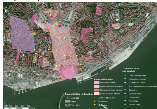
Figure 4 – Map showing exposure of the heritage of ‘Baixa Pombalina’ to flooding (Source: Adapted from Lisbon Municipality, Municipal Master Plan of Lisbon, 2012, and based on field work of the authors).