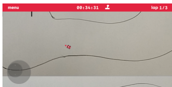
Figure 4: The analog joystick controller