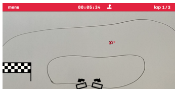
Figure 3: The accelerometer-based tilting controller