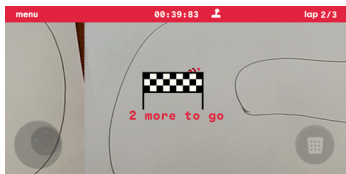
Figure 5: The joystick+button controller

randomly, press the buttons as if they were directional, i.e. right button should move the car to the right of the screen, or keep one button always pressed and press and release the other.