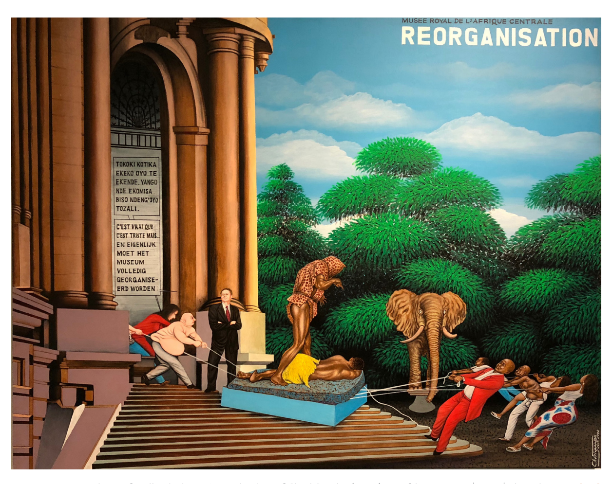
Photo of wall painting Réorganisation, of Chéri Samba (2002), at AfricaMuseum | 2018

In the context of wider discussions about the restitution of museum works, questions emerge throughout the space of AfricaMuseum about its profound relationship with the contemporary moment. These are questions that will also have been raised by each team and every Belgian or Congolese artist or citizen who worked there so intensely for so many years.