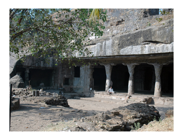
Cave temple at Mandapeshwar, adapted to the church of Nossa Senhora da Piedade in the 16th century.

Around 1720, the Catholic population of the Island of Salsette was estimated at 36,824 people, spread over about twenty-five parishes ( Notf-cias do Arcebispado 1726, 12v-14). However, this society was hardly united. Rather, it was divided into four main social groups: the European born Portuguese, known as "reinóis"; the descendants of Portuguese born in India, the "casados" or "descendentes"; the converted Indian population, who further retained caste consciousness and divisions, often labelled as "naturais" by the Portuguese; and the converted slave population, overwhelmingly of African origin (Boxer 1977, 329-339).