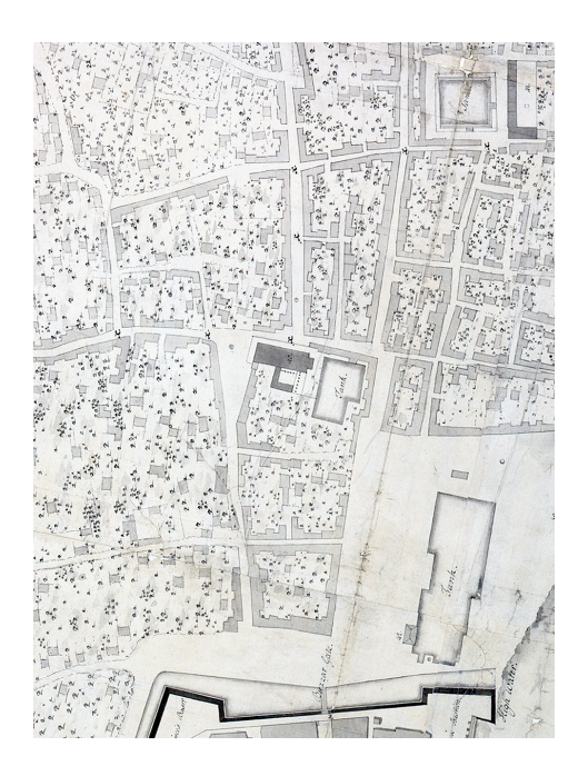
Detail of a plan of Bombay from 1756, showing the original location of the church of Nossa Senhora da Esperança.

Catholic population had been divided into a surprising "double jurisdiction". The return to the Propaganda Fide 's jurisdiction was effected on the 1st of September 1791, through proclamation ( Report from the Select Committee 1817, 487). And through an agreement, reached upon in 1794, half of the Island's four parishes churches – Nossa Senhora da Esperança and São Miguel, in Mahim – were retained by the Propaganda Fide , while the other half – Nossa Senhora da Glória and Nossa Senhora da Salvação – were ceded back to the Padroado 's jurisdiction. However, the agreement also stipulated that the British administration reserved for itself the right to "approve and confirm" priests who were to be chosen by "free election of the parishioners", both in Bombay and Salsette Islands – a measure "derived from considerations of political security" ( Report from the Select Committee 1817, 489; Hull 1927, 150-156).