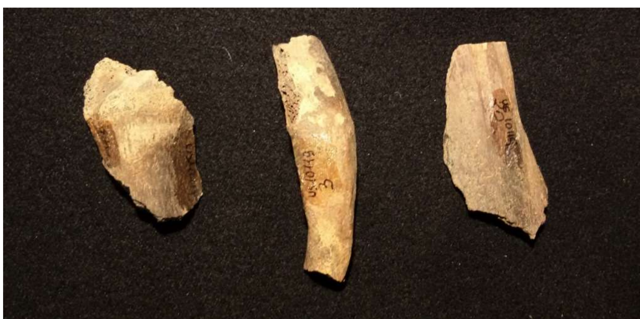
Samples from Neolithic and Medieval period are investigated with neutron probe.

This study aims at developing a reliable method for probing heat-induced diagenesis in human bones of archaeological interest, by INS spectroscopy. The results were coupled to Raman and FTIR data, will lead to an improved understanding of the changes undergone by bone upon burning events, allowing a reliable assessment of the burning conditions.