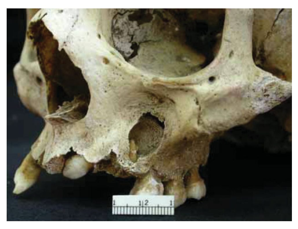
Figure 2. Lateral view of the left maxilla of skull 90, showing the bone lesion together with the root of the offending second premolar protruding into the bony cavity. The first premolar was lost ante-mortem and the canine is impacted. (This is an example of a moderate size apical periodontal cyst and relates to stages D and E in Figure 4). This figure is available in colour online at www.interscience.wiley.com/journal/oa.

right first molar. In general, she had good periodontal condition with no signs of gross vertical or horizontal alveolar crestal bone destruction.