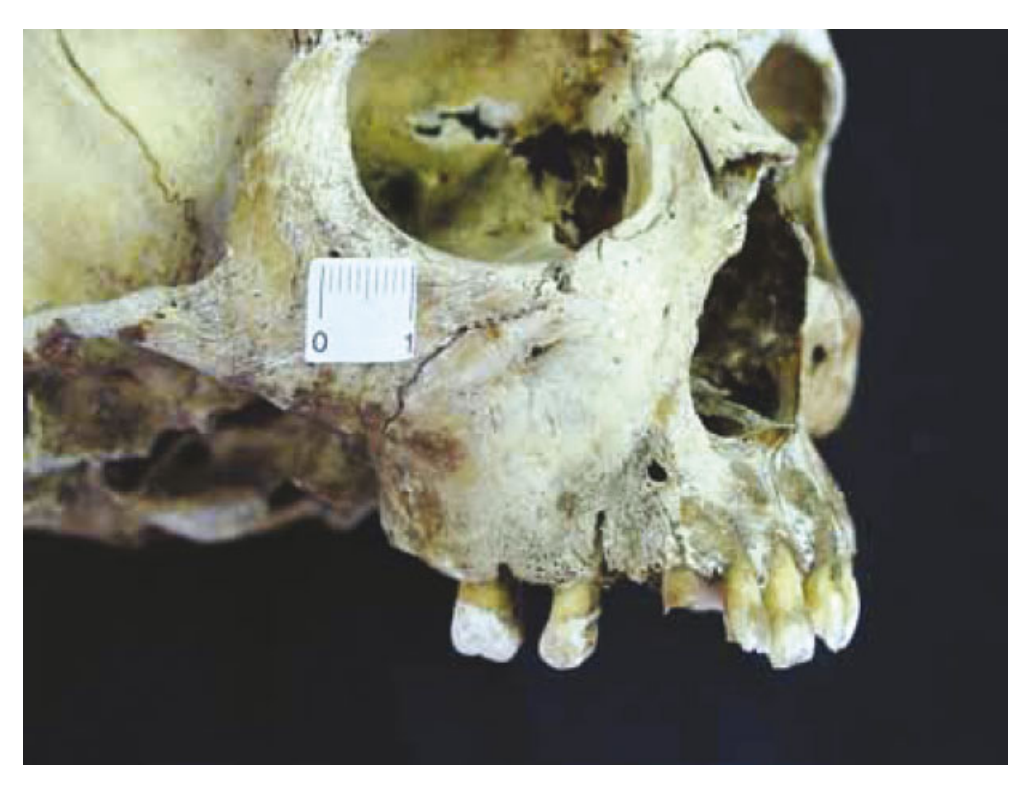
Figure 1. Oblique lateral view of skull 37 showing the right maxilla. The opening on the facial surface of the alveolar bone in relation to the apex of the septic root of the canine is seen (2 × 2 mm). Surrounding the aperture there are signs of bone remodelling. (This is an example of a periapical granuloma, relating to stages A and B in Figure 4). This figure is available in colour online at www.interscience.wiley.com/journal/oa.