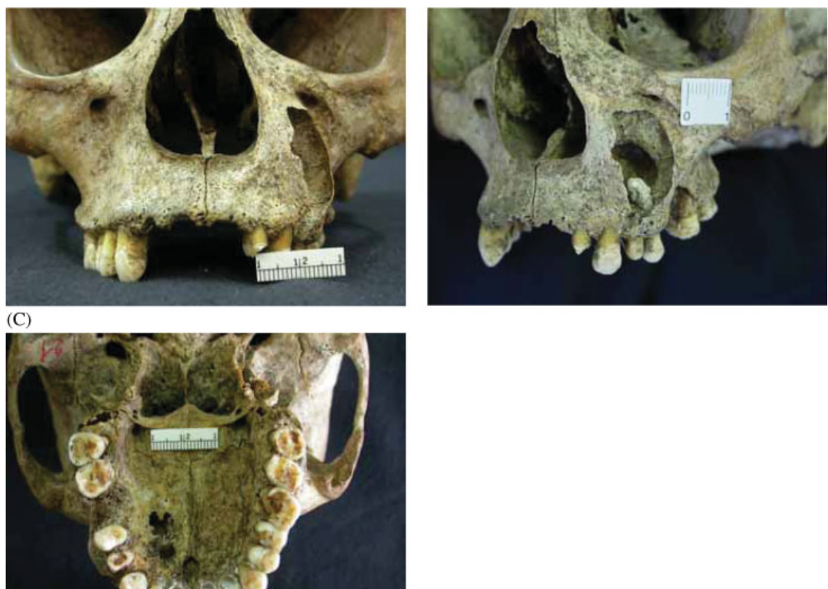
Figure 3. Skull 21 showing a large periapical periodontal cyst. (A) Anterior view of the skull showing the bony expansion of the left maxilla. (B) Oblique lateral view showing the extent of bone loss of the maxilla and the root of the second left premolar protruding into the bony cavity with no sign of resorption, together with hypercementosis at the apical region of the root. (C) Palatal expansion of the cyst leading to bone destruction. (This is an example of a late stage apical periodontal cyst and relates to Figure 4 stage E and beyond). This figure is available in colour online at www. interscience.wiley.com/journal/oa.

There are no signs of loosening of teeth adjacent to the above-mentioned teeth.