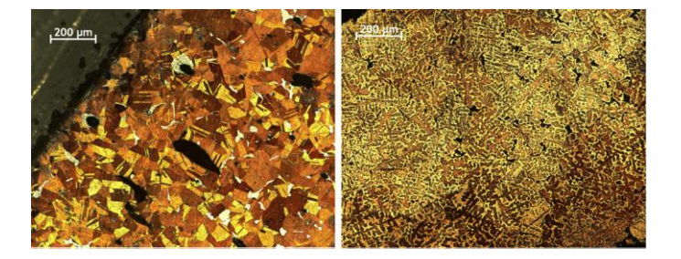
Figure 2: OM-BF (etched) images of an axe with forging and annealing work (left) and of a sword showing a dendritic microstructure characteristic of an "as-cast" metal (right).