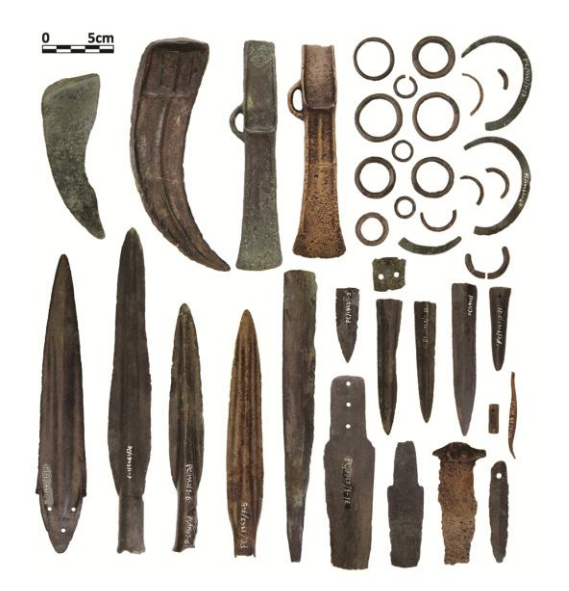
Figure 1: The metals from Porto do Concelho

[1] Bottaini C., Depósitos metálicos no Bronze Final do Centro e Norte de Portugal (XIII-VIII/VII séc. a.C.). Aspectos sociais e arqueometalúrgicos, PhD Thesis, University of Coimbra, Umpublished, 2012. [2] Robbiola L. et al.., Corrosion Science, 40, 2083-2111, 1998.