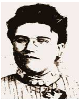
ANA DE CASTRO OSÓRIO