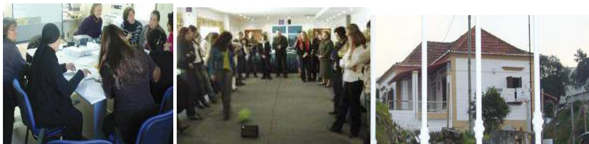
Caption: Activities organised by AMUCIP; AMUCIP's headquarters.

Roma community and, as a consequence, to the promotion of gender equality in that community”. 102