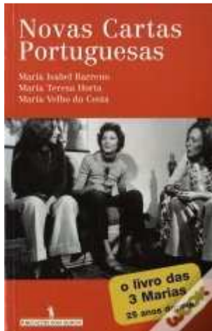
Caption: New Portuguese Letters , feminist book published in 1972.