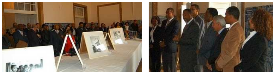
Caption: Opening of the exhibition, at the Belmonte Palace, Lisbon.