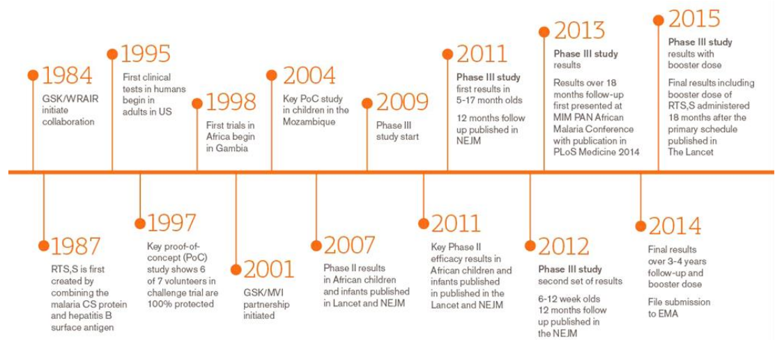
Fig. 2 - The timeline for development of RTS,S through 2015 spans 30 years.<sup>[32]</sup>

The MVTRM was originally launched in 2006 and focused on the urgent need for vaccines to alleviate the ongoing severe disease and death due to malaria. As such, the priority for the global malaria vaccine development efforts was on P. falciparum , children under 5 years of age, in sub-Saharan Africa and other highly endemic regions. The following timeline (Fig. 2) represents the efforts made by GlaxoSmithKline (GSK), since 1984 until 2015, for the development of RTS,S.<sup>[5]</sup>