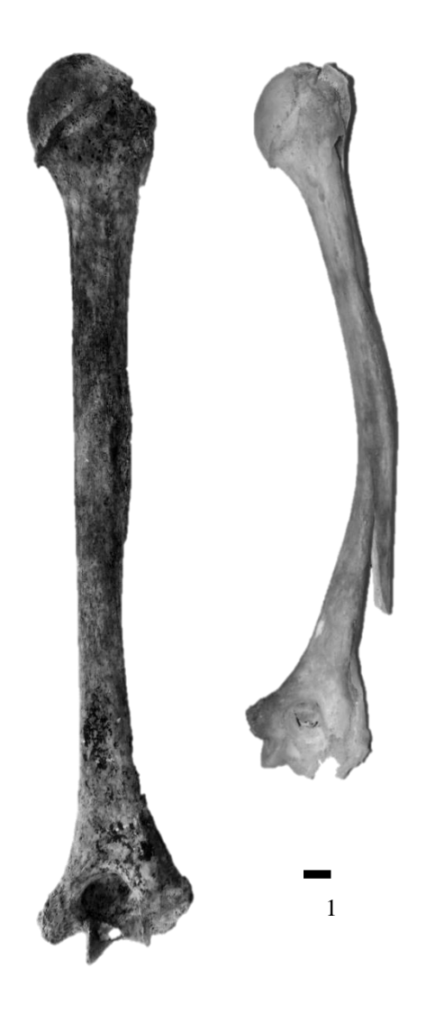
Fig. 3 Comparison between an unburned humerus (left) and a heat-induced warped humerus (right) from the 21st Century Identified Skeletal Collection. The burned humerus was from the individual 65 (an 81-year-old female displaying warping after burning that lasted 116 min and reached a maximum temperature of 900 °C)