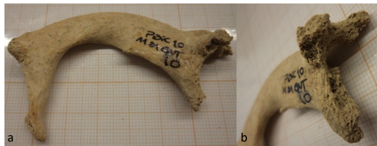
Figure 4. a) Upper view of the first left rib with great destruction of the sternal articular surface; b) Close up of the pathological alterations registered in the first left rib.

Five ribs (four left and one right) show new bone deposits along their shaft. The sternal articular surface of first left rib is noticeably deformed (Figure 4).