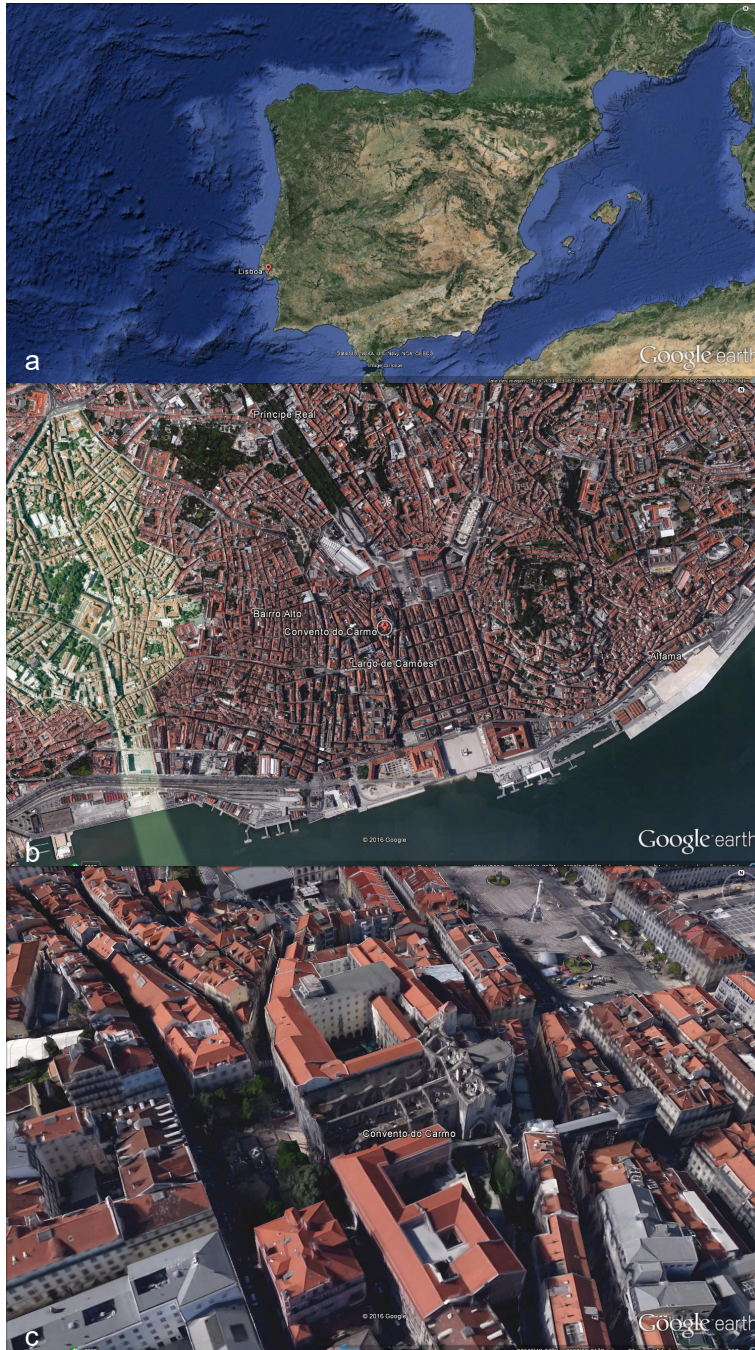
Figure 1. (a) Location of Lisbon in Portugal. (b) Location of the Igreja do Carmo in Lisbon. (c) Aerial view of the Church and Convent of Carmo.

The remains under analysis were recovered from a cemetery located outside the Igreja do Carmo , Lisbon (Portugal) (Figure 1).