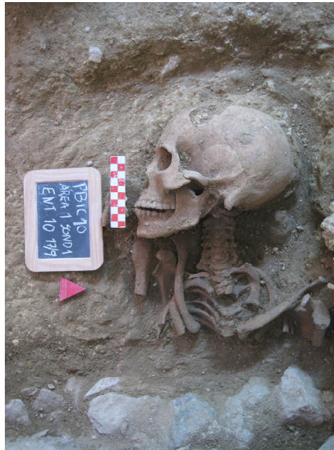
Figure 2. Field photo of the burial of the individual E10 recovered from Igreja do Carmo (Lisbon, Portugal).

The individual ancestry was assessed through non metrical traits, more specifically the cranial morphological traits recommended by Rhine (1990), and through the metrical method programme AncesTrees developed by Navega et al. (2015).