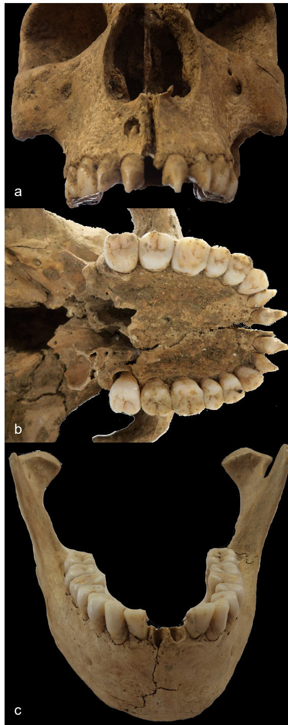
Figure 3. a) Frontal view of the skull and upper dentition. Note the periapical lesion in the buccal plate of the alveolar process at the apex of the root of the right upper central incisor; b) Lower view of the skull and upper dentition. Both central and lateral incisors