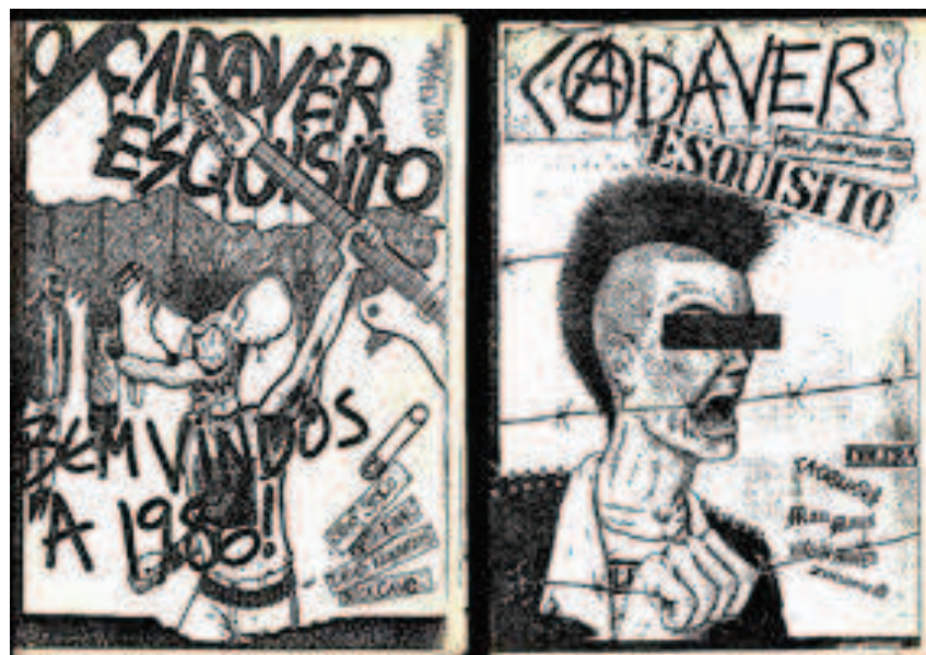
Figure 1 – Front and back cover of the fanzine Cadáver Esquisito (April / May / June 1986)

Following the development of punk scenes in Portugal, we witness during the 1980s a certain proliferation of fanzines although at this stage still largely concentrated in the metropolitan areas of Lisbon and Porto. In this period we can identify relevant punk fanzines such as Subversão (1982), Subúrbios (1985), Tosse Convulsa (1985), O Cadáver Esquisito (1986), Lixo Anarquista (1986-87), Suicídio Colectivo (1987), Anarkozine (1987), Post Scriptum (1987-88), Morte à Censura (1988), Culto Urbano (1988-89), among others.