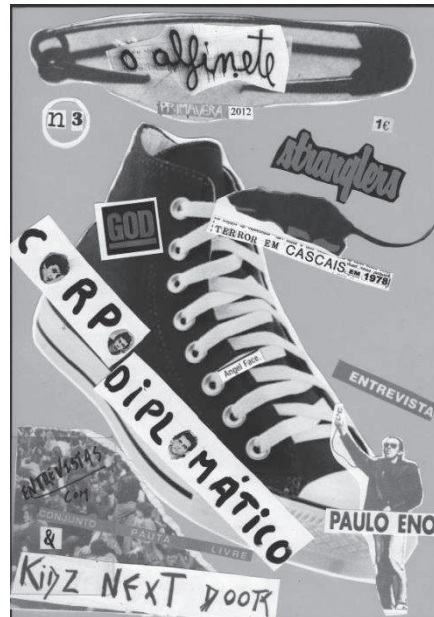
Figure 2 – Front cover of the fanzine O Alfinete (Spring 2012)

Although the beginning of the 2000s is definitely marked by the emergence of several online forums, weblogs and e-zines related with the punk scenes which uses the power of Internet for a quick, easy and inexpensive dissemination of punk bands, records, concerts, festivals, etc., the truth is that traditional fanzines, published on paper and distributed in underground circuits, continue to show a strong resilience (see Graphic 1). Although it contains some specific characteristics associated with the punk universe, this is a trend that is part of broad sense of appreciation of retro, analogue, vintage and also to a certain aesthetic and ethic memory associated with some cultural manifestations. In fact, and although taking different shapes of the past, nowadays traditional fanzines – published on paper - continue to be powerful spaces to affirm a certain do-it-yourself spirit inspired by punk culture, integrating text and image contents in a unique way, like there is in no other medium.