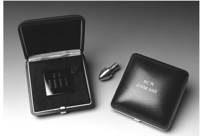
Fig. 2. The reference material BCR-692.

It was essential for the certification exercise to use styli conforming to the specifications for Rockwell C indenters [4] in order to reduce as far as possible variability in measured critical load values due to stylus irregularities or damage. Therefore, improved positioning techniques were used during stylus manufacturing, combined with the selection of appropriate wheels for preliminary grinding and polishing steps. Moreover, crystal orientations were checked by Laue diffraction before grinding. Tip radii and geometry were determined by an optical contour technique, knife-edge profilometry, interferometry and Twyman-Green interferometry. It