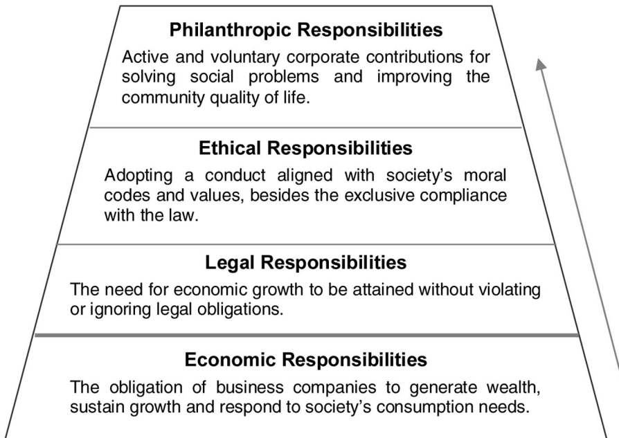
FIGURE 1 Corporate social responsibilities (adapted from Carroll, 1979, 1999).

This pyramid structure highlights Economic responsibility as the foundation of all other responsibilities, which in turn are assumed by corporations in a priority sequence as suggested by the ascending order presented in Figure 1. 2 The classical conception of CSR sets the voluntary commitment of business persons above strictly economic or legal obligations (McGuire, 1963), which highlights, under Carroll's model, Ethical and Philanthropic responsibilities. Ethical responsibility is related to a conduct that, although not imposed by law, is socially desirable and ethically justifiable, whereas Philanthropic responsibility implies a direct corporate involvement through donations or transfer of resources in initiatives aimed at improving the community's well-being and promoting social development (Ferrell, Fraedrich, and Ferrell, 2002). Although some authors question the validity of the dichotomy set up by Carroll between the economic and the social dimension of CSR (Mitchell, Agle, and Wood, 1997), his proposals were the basis for some of the most significant later theoretical developments, such as the works of Wartick and Cochran (1985) and Wood (1991).