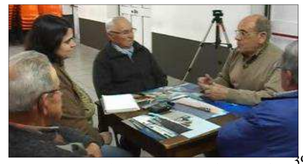
Focus group Casa do Povo, Porto Martins, Terceira. Video still capture.