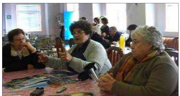
Focus group Casa do Povo, Porto Judeu, Terceira. Video still capture.

In the next section, as a nod to the photo elicitation focus groups, photos are offered as a visual conversation, to be considered simultaneously while reading text conversations. Follow these multiple dialogues by what catches the eye, ear and imagination. The selection and presentation of photos is deliberate, inviting broad and open meaning-making, hopefully allowing dynamic social constructions of meaning. (The two photos below, however, are used mainly to illustrate part of what is written above.)