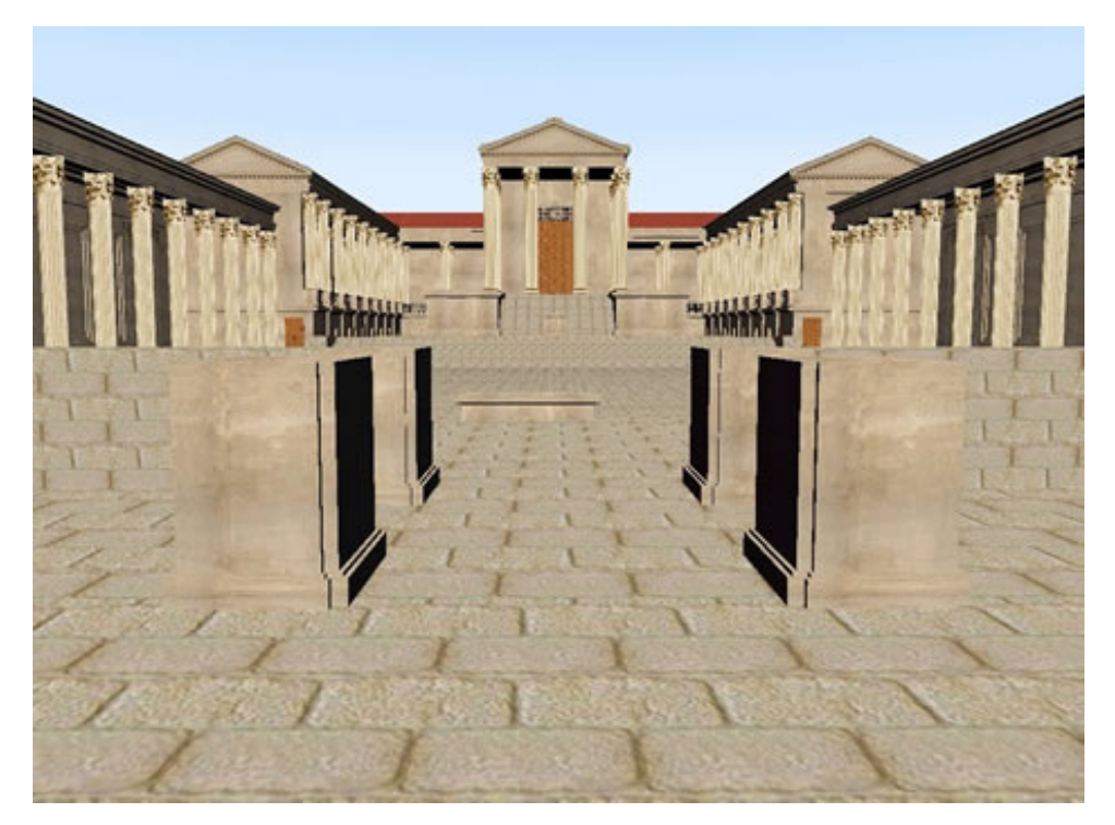
Figure 2 View (in greyscale) of the main entrance of the Virtual Flavian Forum of Conimbriga