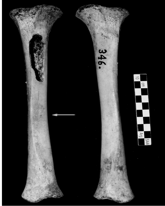
Figure 3. A. Tibiae from individual 346. The upper diaphysis of the right bone shows the opening produced by trepanation. The arrow points to a slight area of new bone formation.