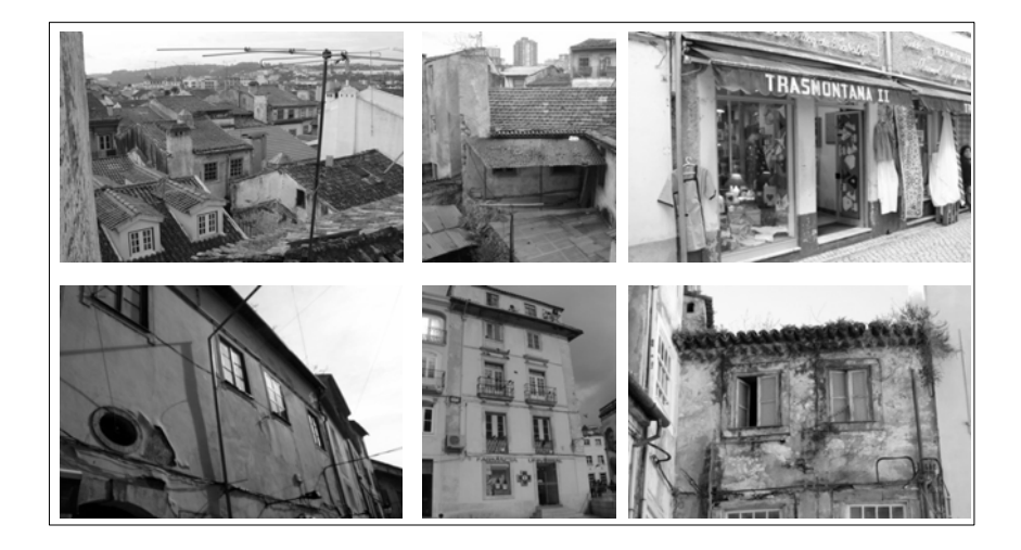
Figure 1: Historical Coimbra city centre images

After defining the main areas involved in the assessment of sustainability, discussed earlier, it were defined the analysis' parameters for each one of them, based on the characteristics of the historical areas of portuguese cities, the sustainability principles and the strategies outlined by the Urban Rehabilitation Corporations that exist, such as in Lisbon, Porto and Coimbra. The particularity of these urban areas requires detailed knowledge of its evolution, the constraints and potential impacts of their specificities. While the physical conditions of buildings, the age of residents, the conditions of infrastructure and urban space constraints are important, the historical and cultural value, the urban memory urban, the economic activities and the built environment are key factors that characterize the enormous potential of these areas. Figure 1 shows some images of the historic area of Coimbra's downtown.