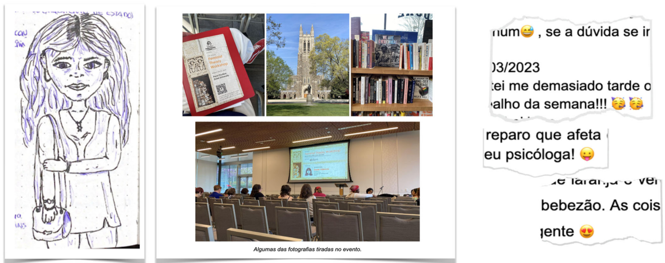
Figure 2. A selection of illustration, photographs, and emoji uses in diaries. Source: [37].