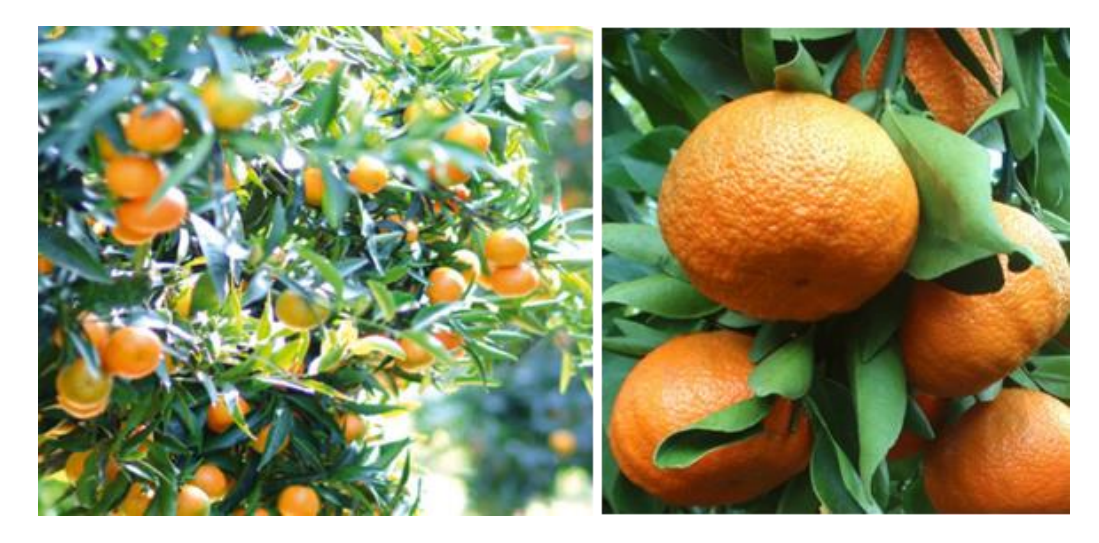
Figure 2. Citrus \times clementina Hort. Ex Tan.

Ruberto et al. [42] studied the profile of two hybrids of C. clementina × C. sinensis (A146 and C1867) and their parents and grouped the 42 identified compounds into monoterpene hydrocarbons, oxygenated monoterpenes, sesquiterpenes and aliphatic aldehydes/alcohols.