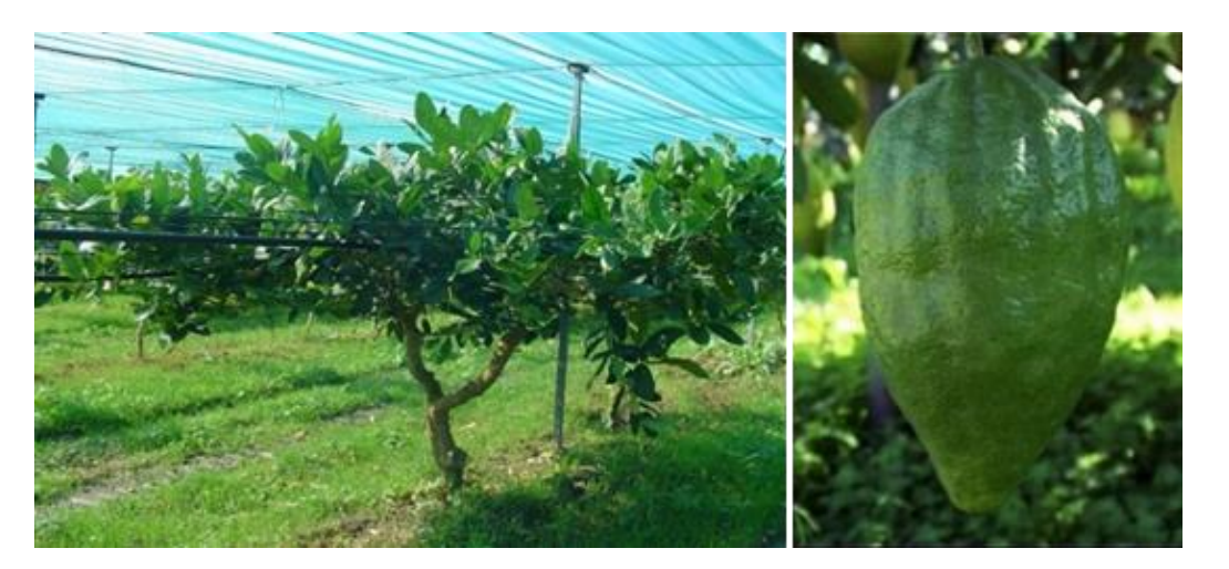
Figure 1. Citrus medica cv. Diamante.

These constituents also characterized the EO from leaves. However, some differences can be highlighted. Leaves EOs were richer in neral (165.2 mg/kg), geranial (175.8 mg/kg), and geranyl acetate (38.5 mg/kg) than peel EOs. On the other hand, peel EO has a higher content of nerol + citronellol and geraniol.