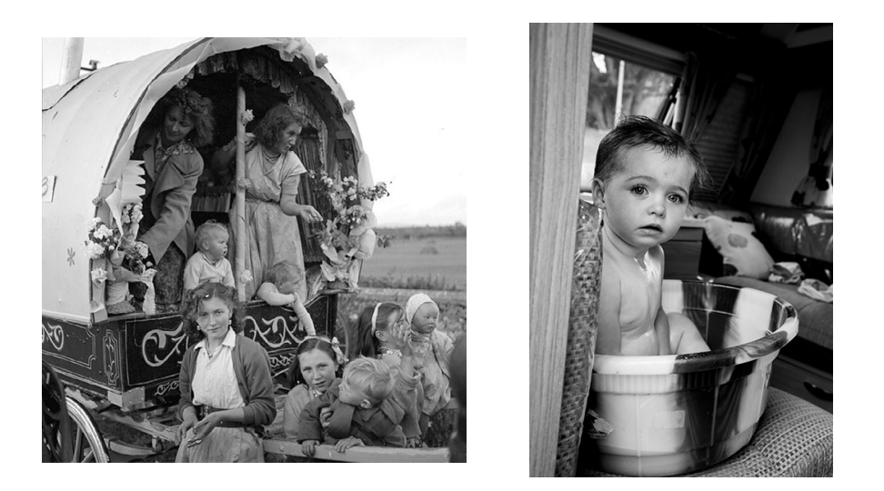
Photo 3 (left): Traveller's caravan, 1954. https://en.wikipedia.org/wiki/Irish_Travellers Photo 4 (right): https://www.creativeboom.com/inspiration/ growing-up-travelling-photographs-that-reveal-the-inside-world-of-irish-traveller-children