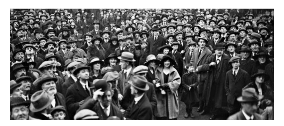
Photo 1: Crowd outside Earlsfort Terrace Photo: NLI The Independent Newspapers (Ireland) Collection: Call no: INDH112A

The photo at the beginning of both articles is the same, showing a huge crowd, intensely looking at something "in common":