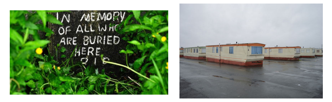
Photo 6 (left): Memorial in Tuam's mother and baby home https://www.irishtimes.com/news/social-affairs/mother-and-baby-homes Photo 7 (right): Direct Provision Centre in Athlone. https://en.wikipedia.org/wiki/Direct_provision

https://www.irishtimes.com/opinion/cruelty-and-abuse-of-power-were-not-the-preserve-of-religiousorders-1.4479202