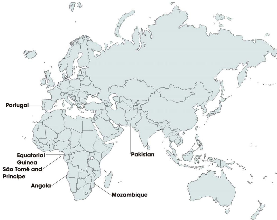
Figure 1. Geographic location of the countries Mozambique, Angola, Sao Tome and Principe, Equatorial Guinea (Africa), Pakistan (Asia) and Portugal (Europe).