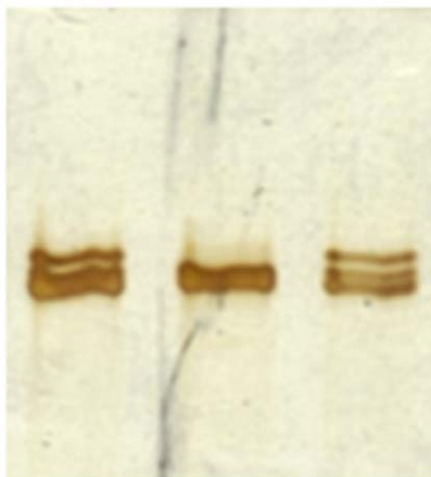
Figure 2. SSCP results showing a migration pattern alteration in the exon 7 amplicons caused by the G829A substitution (10% acrylamide-bisacrylamide gel) - samples at the extremes (wild type isolate in the middle).

This is the first study aimed at determining PK deficiency occurrence as well as at studying a potential widespread PKLR mutation in the African continent.