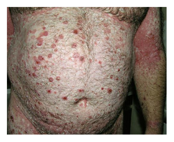
Fig. 2. Polymorphous clinical appearance of early lesions.