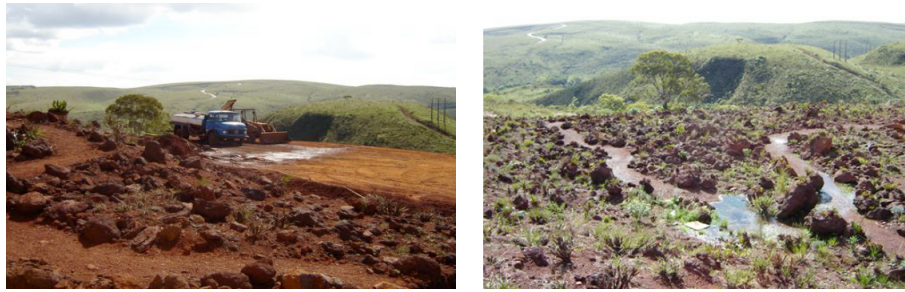
Figure 1. Surrounding area of the park headquarters before and after the canga vegetation translocation.