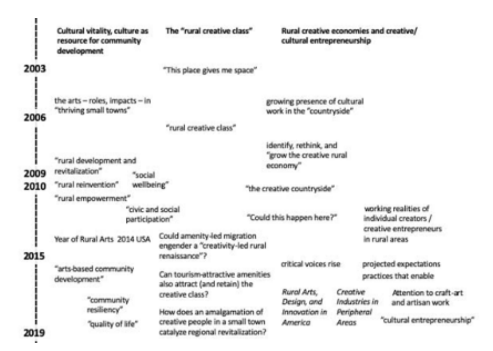
Figure 1. Trajectories of key themes in the literature

Overall, the research found that culture-based and creative work in rural and remote areas has largely been examined and articulated through three storylines: (1) cultural vitality, that is, culture as a resource for community development; (2) the 'rural creative class', recently linked to rural innovation; and (3) rural creative economies and creative entrepreneurship in rural and remote areas. An overview of key themes in these trajectories is presented in Figure 1. All three storylines are still actively in force, individually and sometimes joined-up/mixed. As new research and policy-related initiatives emerge, it seems a timely point to better understand, reconcile, and perhaps converge these somewhat parallel discussions into a more comprehensive approach to fostering cultural and creative work in rural and remote areas.