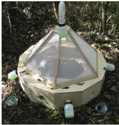
Figure 1. Modified Schoenly trap.