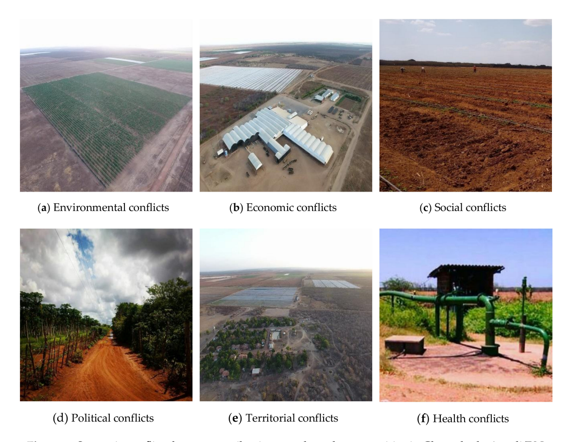
Figure 3. Systemic conflicts between agribusiness and rural communities in Chapada do Apodi/RN: (a) Environmental conflicts with landscape substitution and ecosystem services of the caatinga by planting irrigated meon. (b) Economic conflicts with the expansion of the agribusiness complex. (c) Social conflicts with seasonal jobs in the preparation of land for planting. (d) Conflicts between political agribusiness actors with monoculture system and family farming with sustainable management of the caatinga. (e) Territorial conflicts due to the expansion of agribusiness to close to the areas of family farming. (f) Health conflicts with access to water being prioritized for agribusiness.

The conflict may derive from the dispute of the same resource base or different bases but connected by ecosystem interactions mediated by the atmosphere, soil, and, waters [42]. From this perspective, it is evident that Chapada do Apodi-RN is configured as a territory that is currently in transformation due to the expansion of agribusiness, which results in conflicts with local rural communities (Figure 3).