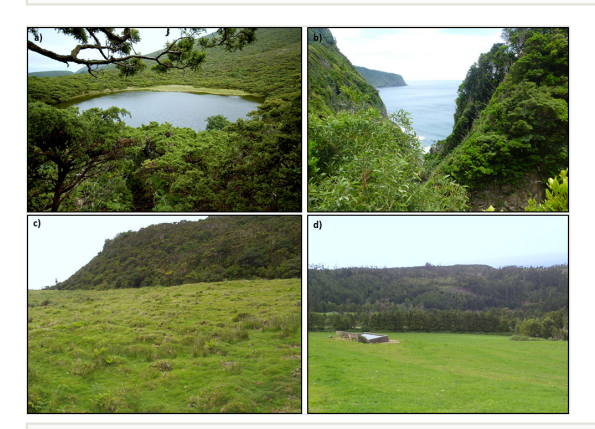
Figure 2. doi

Habitat types in Terceira and São Miguel Islands, Azores: a. native forest of Juniperus brevifolia ; b. native forest of Picconia azorica ; c. semi-natural pastures; d. intensively-managed pastures.