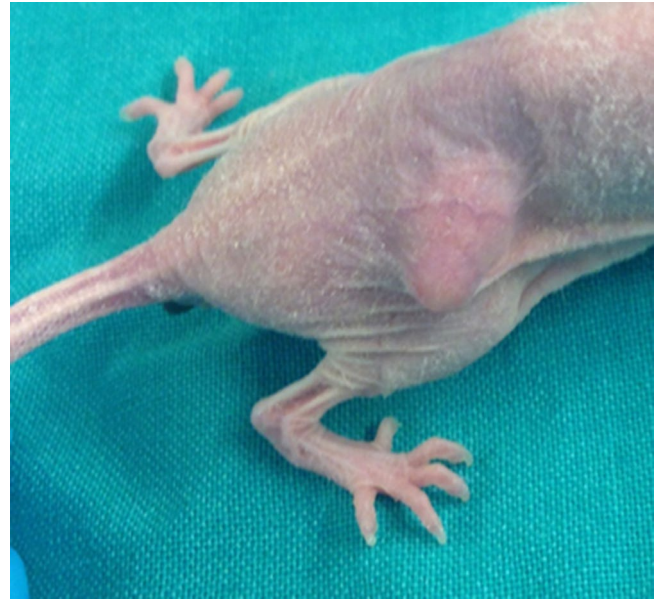
FIGURE 1 A mice exhibiting a subcutaneous heterotopic tumor—in this case, the cells were inoculated at the right side of dorsum

In the last decades, the xenograft model has been adopted as a way to bypass the limitations of the cell culture model. Tumor cell lines or suspensions are injected subcutaneously in mice, that in order to prevent tumor rejection usually are nude (unable to produce T cells) or have immune deficiency 34 —Figure 1. This type of model was a large success and nowadays it is widely used by researchers around the world to induce CRC in mice for carcinogenesis study and response to therapeutics. 42-44 But like other models, the xenograft model has its limitations, one of them, the low metastatic capacity, reason that