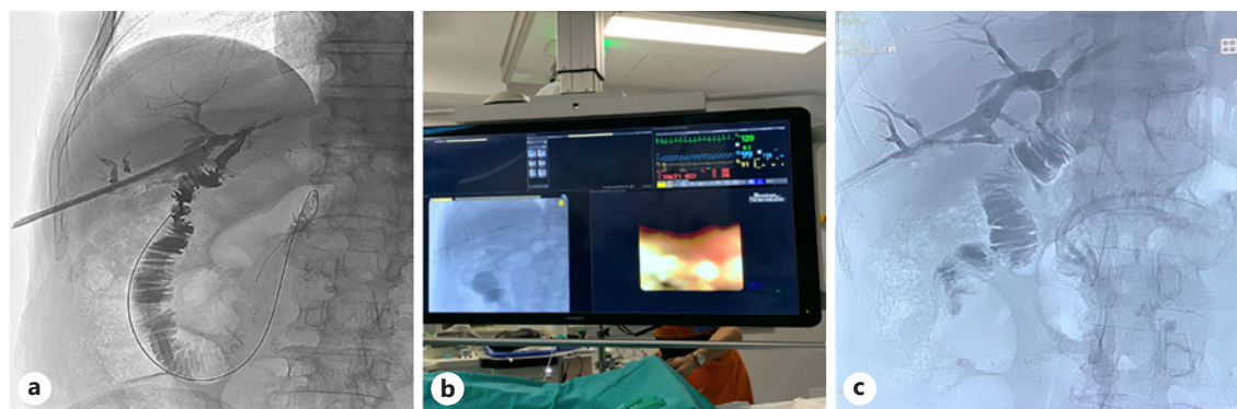
Fig. 2. a Initial cholangiography displaying the 12 Fr sheath and multiple filling defects in the right posterior sectorial duct and no filling of the left hepatic duct, but with permeable anastomosis. b, c Simultaneous radiological and endoscopic percutaneous approach of the biliary tract reflecting the importance of a multidisciplinary team approach in cases such as these. The dual monitoring system allowed for the precise confirmation of the cholangioscope, enabling the clearance of the entire intrahepatic biliary tree.

with a dual-image system displaying the progression of the procedure with cholangiographic images alongside the cholangioscopic view, enabling the exact location of the cholangioscope inside the biliary tree, particularly of the most affected ducts (right posterior sector and left hepatic duct) (Fig. 2) [2]. During the procedure, the anastomosis was confirmed to be patent, and laser lithotripsy with Holmium Laser System™ (5Hz, minimum power – increased as needed) [3, 4] (Fig. 3) and Dormia basket lithotomy [2] of intrahepatic stones were performed. Completion cholangiogram showed absence of major filling defects. However, since some debris remained even after copious lavage, a percutaneous transanastomotic drain was left in order to prevent cholangitis. This was