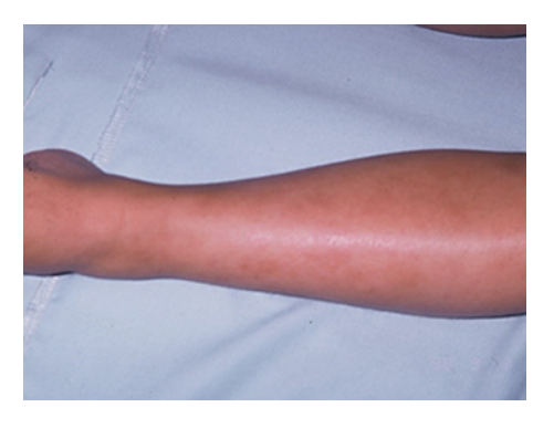
Fig. 2. Racemosa livedo reticularis.

At the end of the seventh year of life, she began a prolonged fever syndrome (PFS) for 95 days, abdominal pain, hepatomegaly, splenomegaly, polyarthralgias, livedo racemosa (Fig. 2), and ocular episcleritis. Laboratory tests described in Figure 1 revealed a worsening hemoglobin of 8.5 g/dL, high ESR 115 mm/h, and CRP 20.5 mg/dL. All etiological investigation for infectious prolonged fever was negative; the serum angiotensin converting enzyme (SACE) antineutrophil cytoplasmic antibody was normal or negative; human leukocyte antigen (HLA) class 1 molecule B27 (HLA-B27) was positive; complement C3, C4, and CH50 were normal. One year later, due to a protracted pneumonia, a chest computed tomography was performed that revealed "subsegmental collapse in the middle lobe with incipient cylindrical bronchiec-tasis and multiple enlarged mesenteric and para-aortic ganglia." Immunodeficiency investigations disclosed decreased chemotactic activity of neutrophils and deficit of CD15 expression in leukocytes, and studies of phagocytosis and respiratory explosion of granulocytes and monocytes did not show any changes. Serum immunoglobulin concentrations disclosed low IgG (4.6 g/L [ N 5.6–13.8]) and IgM levels (0.3 g/L [ N 0.47–2.0]) but normal IgA levels (1.0 g/L [ N 0.24–2.32]).