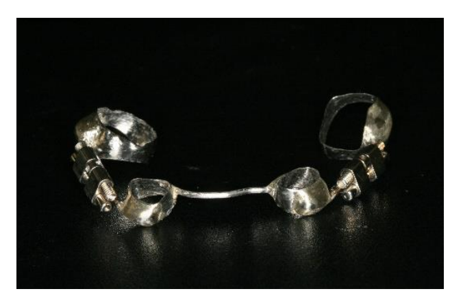
Figure 1. Photography of the custom-manufactured dental-anchored distractor.

A new custom-manufactured dental-anchored distractor design was elaborated and anchored in the firs molar and lower canine. It consists of a stainless-steel disjunction screw, adapted, and welded to the orthodontic bands through two 1.2 mm diameter connector bars, with universal silver-based and cadmium-free solder, 0.1 mm in diameter (Figure 1). The mechanism of the screw is the rotation-pressure type, allowing the dismultiplication of the effort for the elongation, with a maximum expansion of 12 mm. The rotational movement of 360^{\circ} around its axis produces a translational movement along this axis (sagittal elongation) of 0.8 mm. A single screw activation allows only a rotation of 90^{\circ} (1/4 turn), producing a 0.2 mm elongation, and features a brake system that prevents the accidental return of the activation.