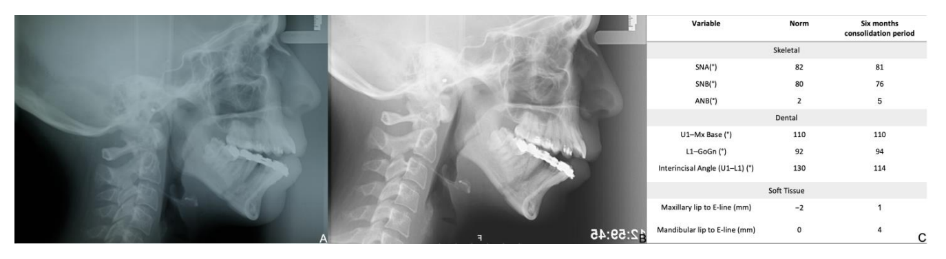
Figure 6. Post-surgical records: lateral cephalogram immediately after the active period of distraction ( A ) and with six months consolidation period ( B ); ( C ) cephalometric measurement with six months consolidation period.