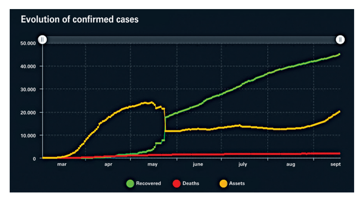
Source: Portugal. Direção Geral da Saúde. COVID-19. Ponto de situação atual em Portugal. Portugal: Direção Geral da Saúde; 2020 [citado 2021 Jan 11]. Disponível em: https://covid19.min-saude.pt/ponto-de-situacao-atual-em-portugal/<sup>®</sup> Figure 3. Total cases and deaths in Portugal until September 19, 2020. Data that can be optimized and updated in real time using the application

COVID-19 pandemic. This application was developed by the Decentralized Privacy-Preserving Proximity Tracing" (DP-3T or dp3t, - Decentralized Privacy-Preserving Proximity Tracing) initiative and by the Institute for Systems and Computer Engineering, Technology and Science (INESC TEC). This initiative assumed the responsibility of the development of a complete system that could be implemented to support in Public Policies to combat COVID-19.