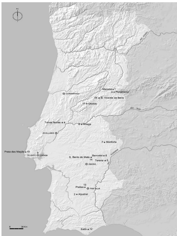
Fig. 1.4. Monuments' locations. Map by José Luís Madeira. Reproduced with permission.

The ex-voto to Victoria (No. 3), made for the health of the dedicator himself, suggests a military environment. Victory will certainly help against diseases; however, good physical condition was essential to obtain it. And it was nearby that a campus – possibly military – was consecrated to the emperor’s health! (nº 1).