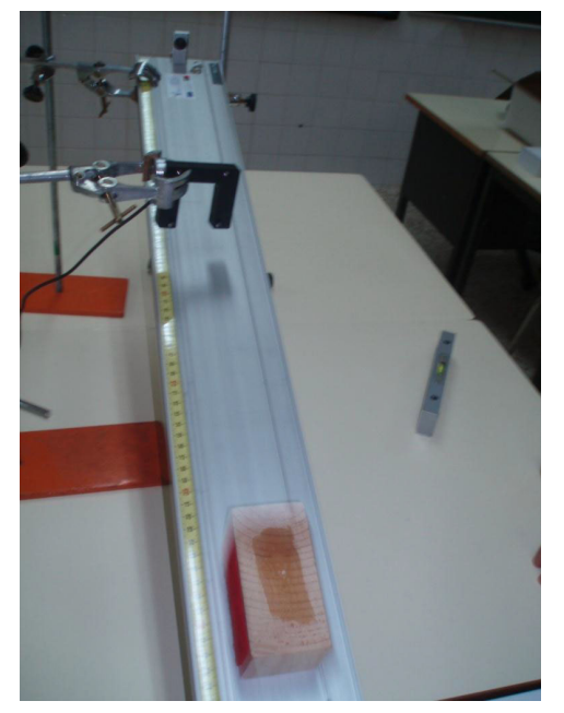
Figure 4. Real scenario with an inclined plane experiment.