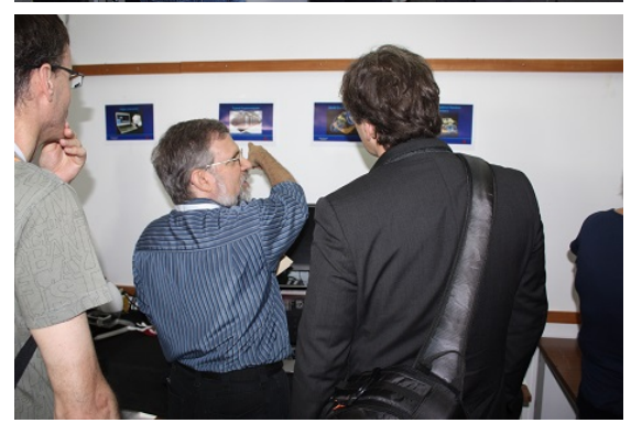
Figure 2. Authors and participants interaction during Exhibition Sessions within expat'15.

During the Exhibition Sessions authors had the opportunity to demonstrate and explain to the participants the main features of its resources. The presented demos based in different used technologies were examples of online experimentation in a wide range of application areas.