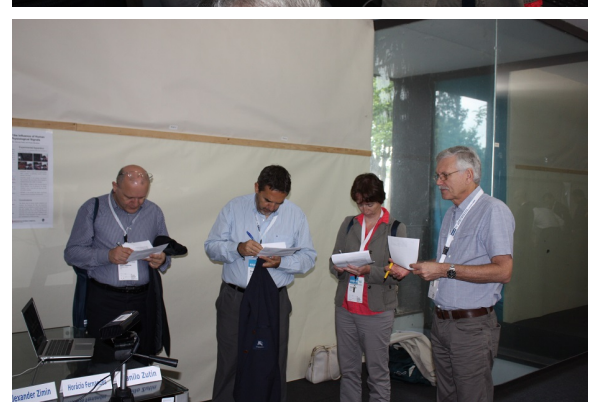
Figure 1. Authors and jury interaction during Exhibition Sessions within expat 15.