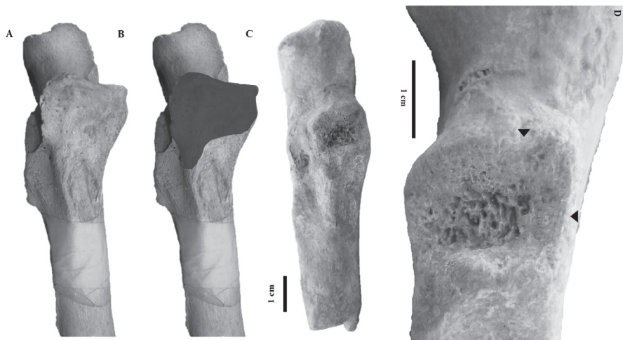
Figure 2. A. Right ulna with an unaffected coronoid process. B. Right ulna showing the affected area, represented by a grey shadow: C. Right ulna recovered at Buraca da Moira Rock Shelter. Note the absence of a large portion of the coronoid process. D. Detail of the affected area exhibiting signs of bone remodeling (black arrowheads).

condition that deviates from what is considered normal". In a developing embryo, several epigenetic, intrinsic and extrinsic factors may impair molecular signaling, interfering with the timing of development and differentiation of the embryonic tissues (Barnes, 2008; 2012). In the human skeleton, some developmental disturbances may cause delay, disorder or absence of tissue segmentation and ossification (Barnes, 2012).