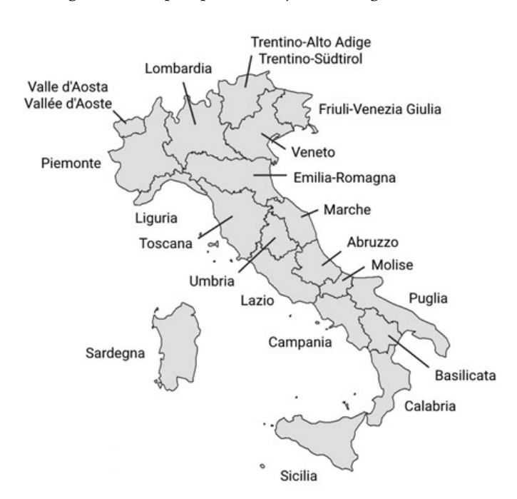
Figure 2 – Map of present-day Italian regions