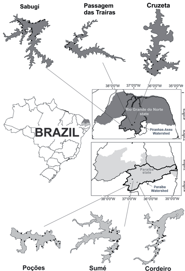
Figure 1. Location of reservoirs and respective sampling sites. Sabugí, Passagem das Traíras, and Cruzeta reservoirs located in the Piranhas-Assu watershed, Rio Grande do Norte and Poções, Sumé, and Cordeiro reservoirs located in the Paraíba watershed, Paraíba, Northeastern of Brazil. Figure in Jovem-Azevêdo et al. (2019). Localização dos reservatórios e respectivos locais de amostragem. Os reservatórios Sabugí, Passagem das Traíras e Cruzeta, localizados na bacia hidrográfica do rio Piranhas-Assu, Rio Grande do Norte e os reservatórios Poções, Sumé e Cordeiro, localizados na bacia hidrográfica do rio Paraíba, Paraíba, Nordeste do Brasil. Figura em Jovem-Azevêdo et al. (2019).

filters (physical/chemical, habitat composition, and landscape) most influence Chironomidae abundance in those three site categories. We tested the hypothesis that the interactions between environmental filters exert a strong influence on the abundance of Chironomidae in sites subjected to different levels of anthropogenic disturbances, due to the interdependence between environmental factors acting on multiple spatial scales.