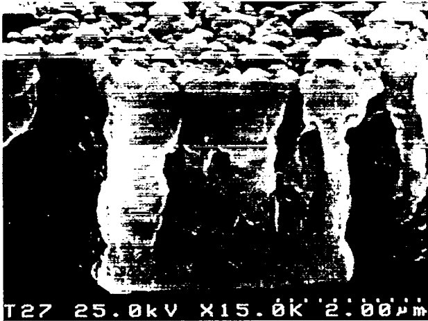
Fig. 1. Scanning electron microscopy cross-section image of the as-deposited TiAlAg 16 film.

equipped with a Vickers diamond indenter. In this work, nine tests at 300 and 70 mN maximum load were performed in each sample. The hardness tests consisted in a loading stage followed by a 30 s holding period (creep) at the maximum load and an unloading stage down to 0.4 mN. This load was then maintained for another creep period of 30 s. During the loading (unloading) stage, the load was increased (decreased) in 60 steps until the maximum (minimum) load was reached. For each step, the load and the penetration depth, h , were monitored as well as the time, t , during the creep periods.